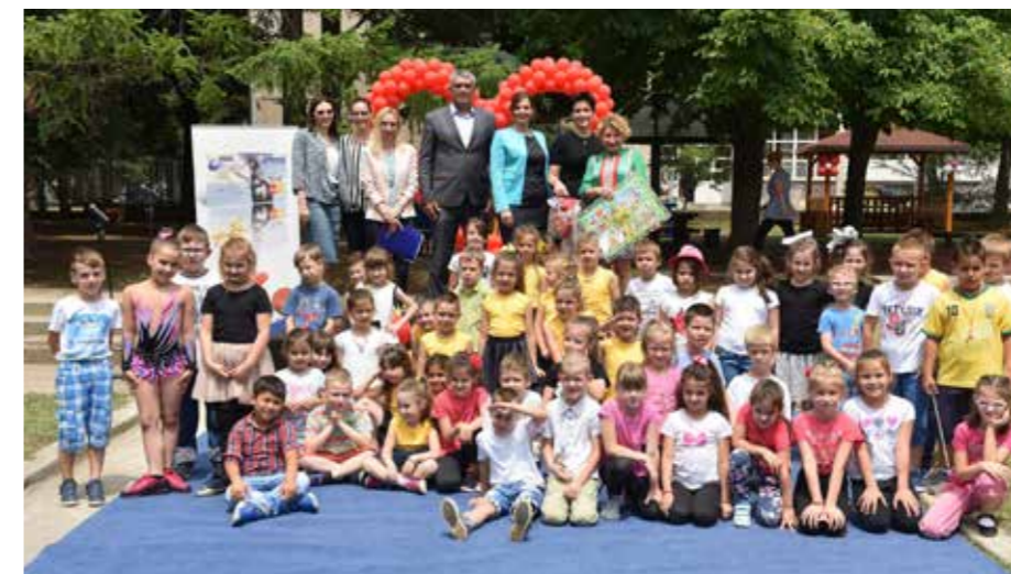
Big Heart in Mladenovac

Since 2010, when the Big Heart project was launched, Eurobank and the Ana and Vlade Divac Foundation have renovated nearly 50 playgrounds in kindergartens, as well as a large number of premises in schools and health facilities where children are staying. Thanks to the activity, tens of thousands of children across Serbia were given quality playing and learning conditions and a happier childhood.