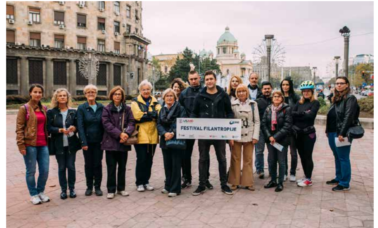
Philanthropy Festival 2018