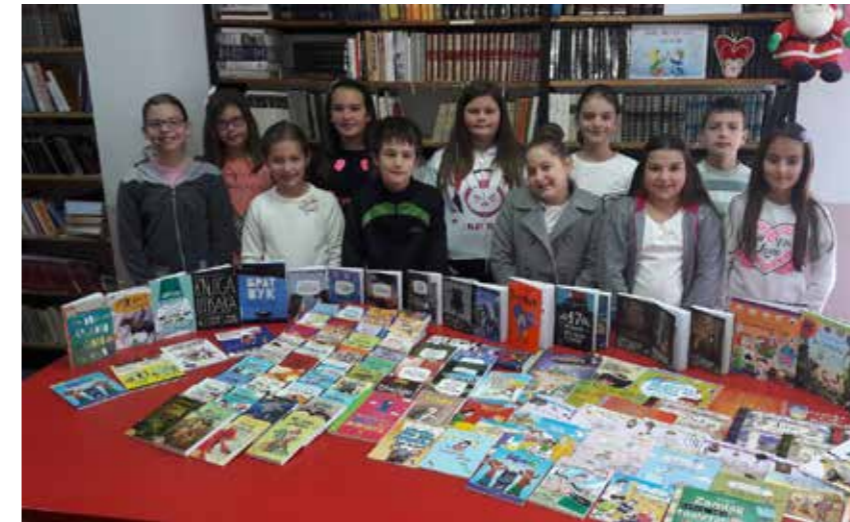
The youngest members of the school library in Stragar, Kragujevac

In 2018, thanks to donations from buyers from the boxes of the Kragujevac Plaza shopping mall, we continue the tradition of renewing school library funds to enhance students' knowledge and contribute to their happier growing up through the time spent with the book.