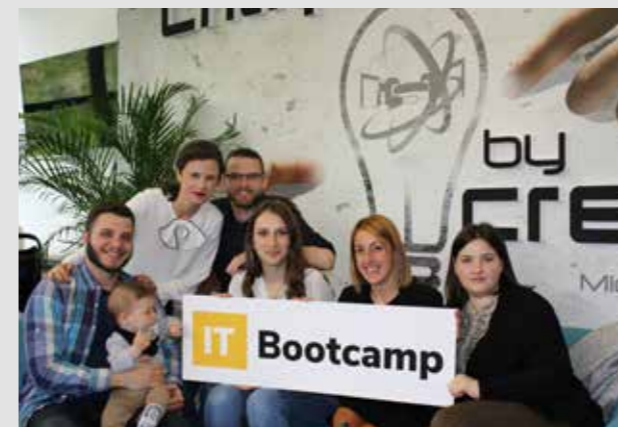
IT Bootcamp – Celebrating Diplomas

Software testing course at IT Bootcamp changed my life! I know, I know, it sounds like a top shop ad, but it really did. Immediately after the course, IT Bootcamp provided me with an opportunity to be interviewed for a job at the company. To my great surprise, I got the job, which brings us back to the part that looks like an advertisement. IT Bootcamp changed my life in two months.