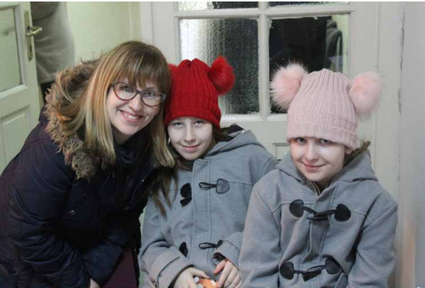
Single mom and her daughters

Within the provision of one-time humanitarian aid, Ana and Vlade Divac Foundation did not forget single-parent families recognized as a category increasingly exposed to poverty and social exclusion. Several thousand single-parent families received food packages within the campaign that the Foundation implemented in cooperation with Public Utility Company "Infostan".