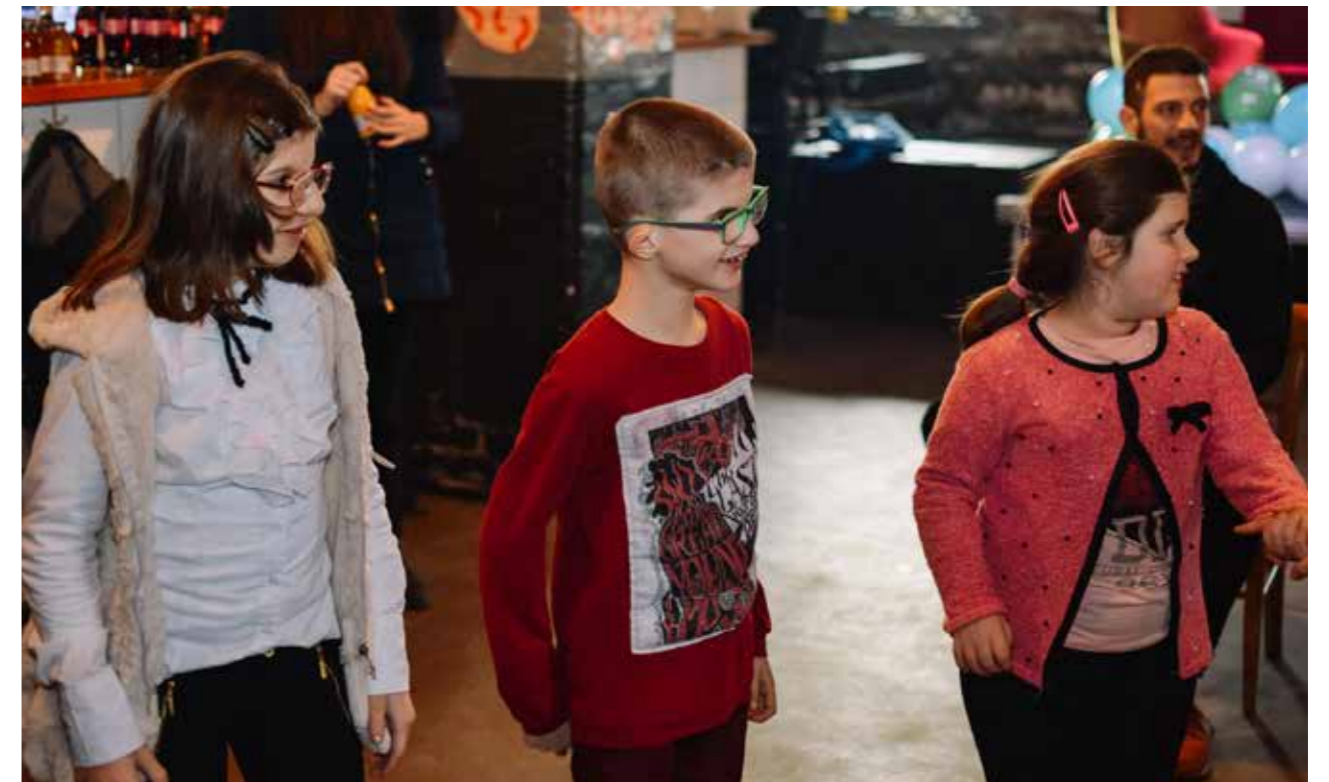
Da rastemo srećni - proslava rezultata u KC Gradu