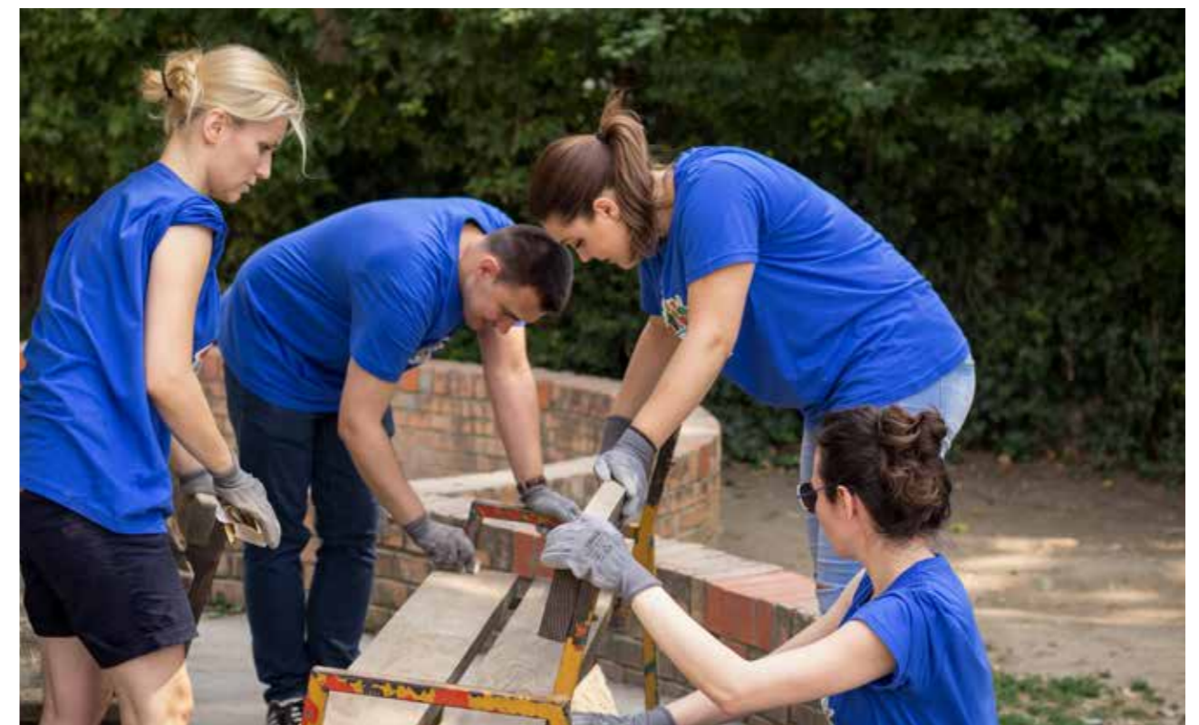
Philanthropy Festival 2018 - Volunteers