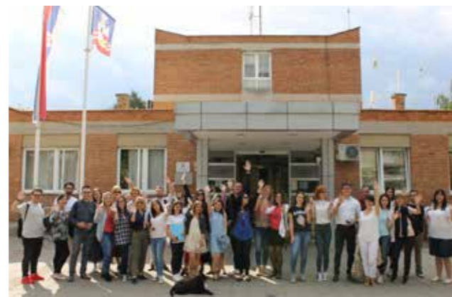
Youth Banks Hub for the Western Balkans and Turkey