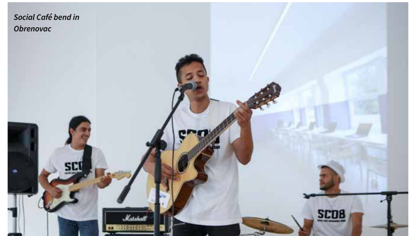
Social Café band in Obrenovac