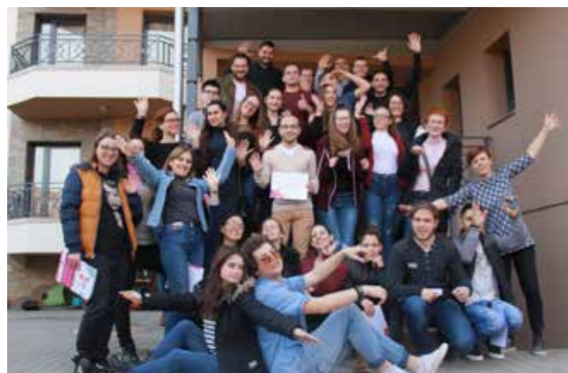
Divac Youth Funds

In 2018, 26 trainings were conducted for civil society organizations, 16 public events that brought together over 500 decision makers at local and national levels, and we published six surveys on the position of young people. The Hub has published a third Youth Participation Index, based on which it collects data and measures the level of youth involvement in the economic, political and social spheres. This instrument for monitoring the position of young people was developed for the first time in Europe. The project is being implemented with the financial support of the European Commission.