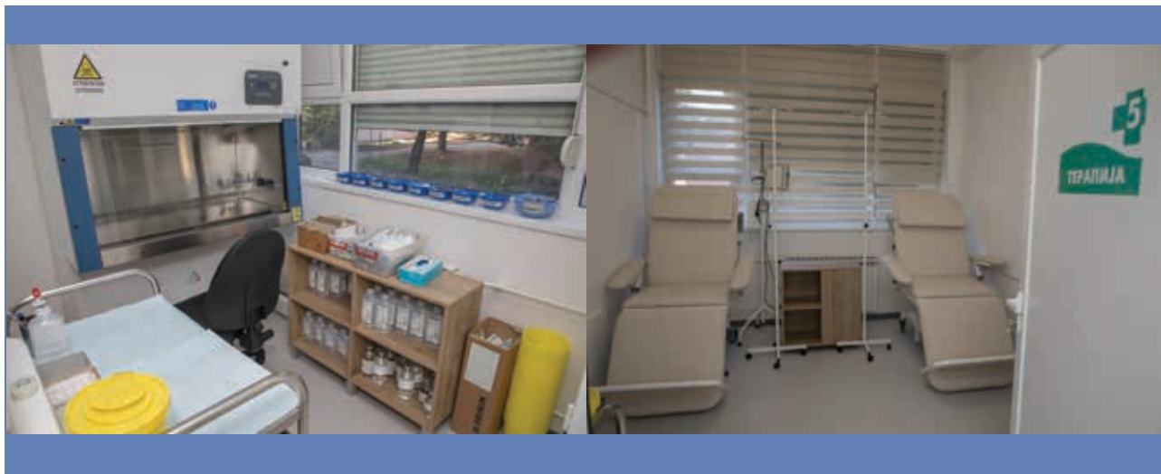
General Hospital Kruševac

The total donation for the General Hospital Kruševac amounted to more than RSD 20 million thanks to the support of long-term donors of the Ana and Vlade Divac Foundation.