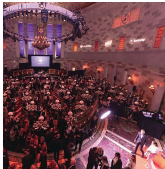
Serbian philanthropic gala dinner in New York

Awards of appreciation were given to individuals and organizations whose charitable work contributed to a better quality of life for Serbian people within Serbia's borders but also in the diaspora. For its contribution to philanthropy in Serbia, the award went to the Association for the Encouragement of Entrepreneurship Živojin Mišić, which gives annual awards to the best teachers in Serbia. The humanitarian organization Serbian-American Medical Association (SAMA) received the award for its contribution to philanthropy in diaspora.