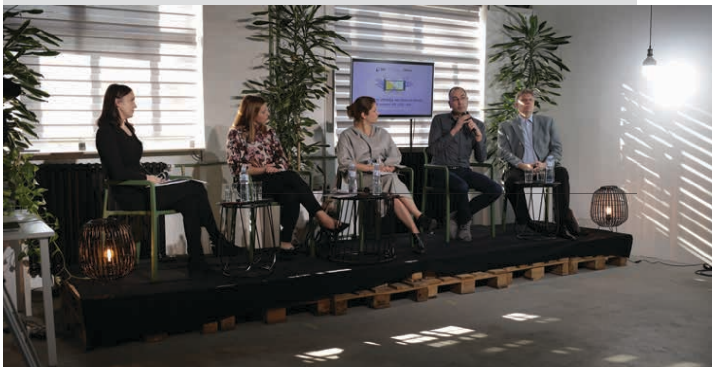
Panel Mental health in the workplace