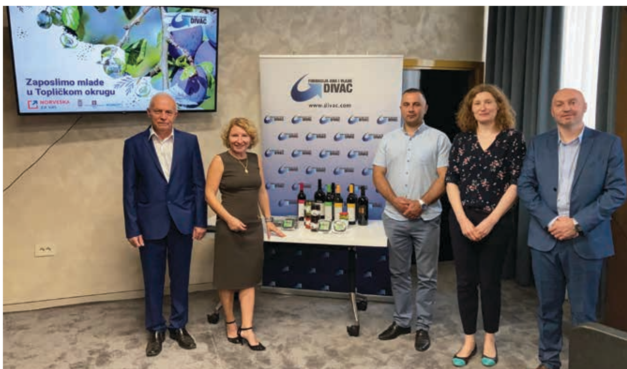
Visit to the Toplica district