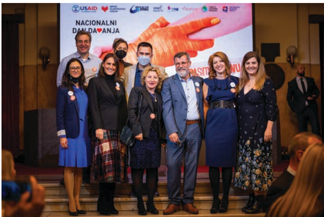
Marking of of the National Day of Giving

Although the pandemic continued to affect many activities and aspects of work during 2021, the Ana and Vlade Divac Foundation, together with partners from the Coalition for Charity, continued working on proposals for the improvement of legal framework and promoting charity, focusing their activities on food donations.