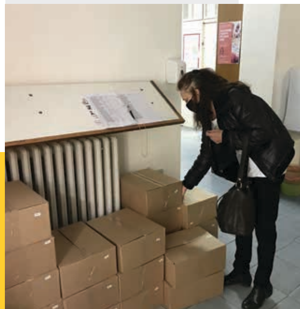
Handing out packages in the Center for Social Work Zvezdara