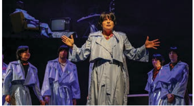
The play Trenutak pre zasićenja

As a consequence of the closure imposed by the COVID-19 pandemic, the culture sector as well as cultural workers have been much affected in previous months, so we supported the