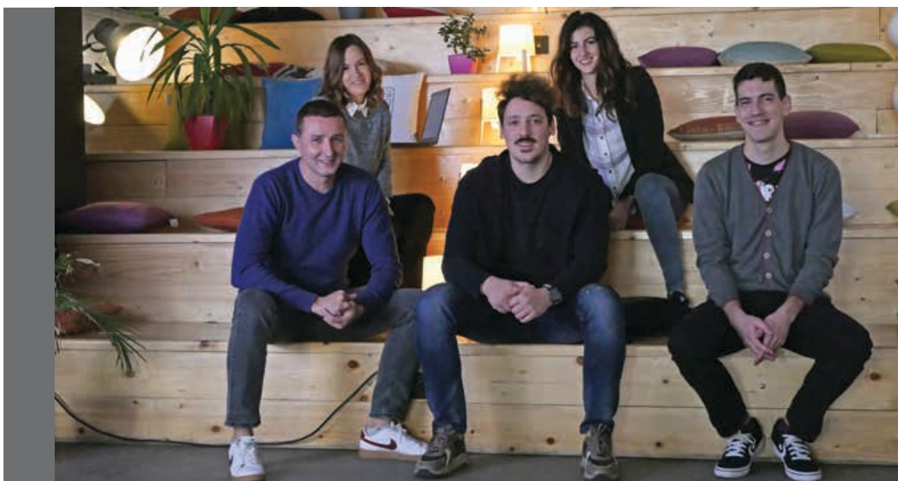
IT Bootcamp 2021