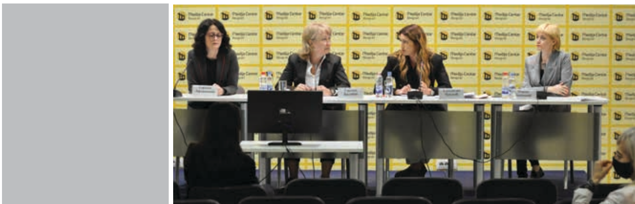
Project Equal - Press Conference

Read more about the project on www.jednaki.com