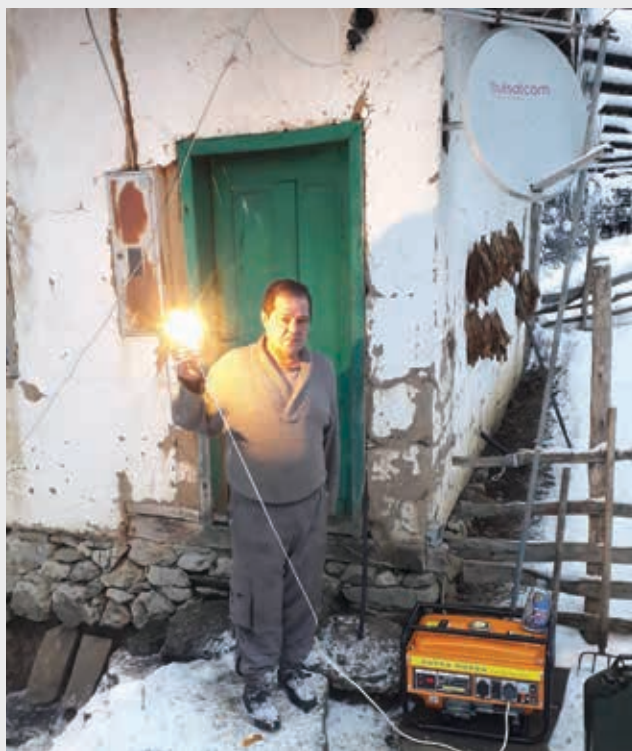
Aggregate donation, Kuršumlijska banja