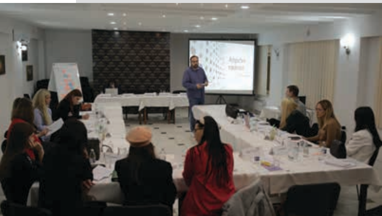
Labor, Human Rights and Gender Academy