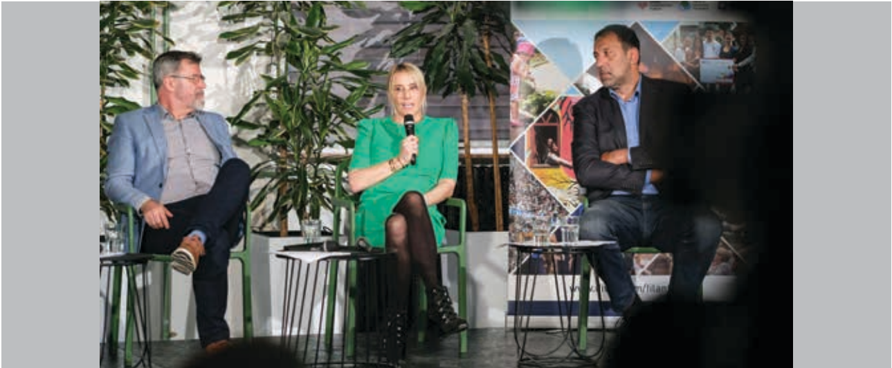
Panel on the cooperation with diaspora