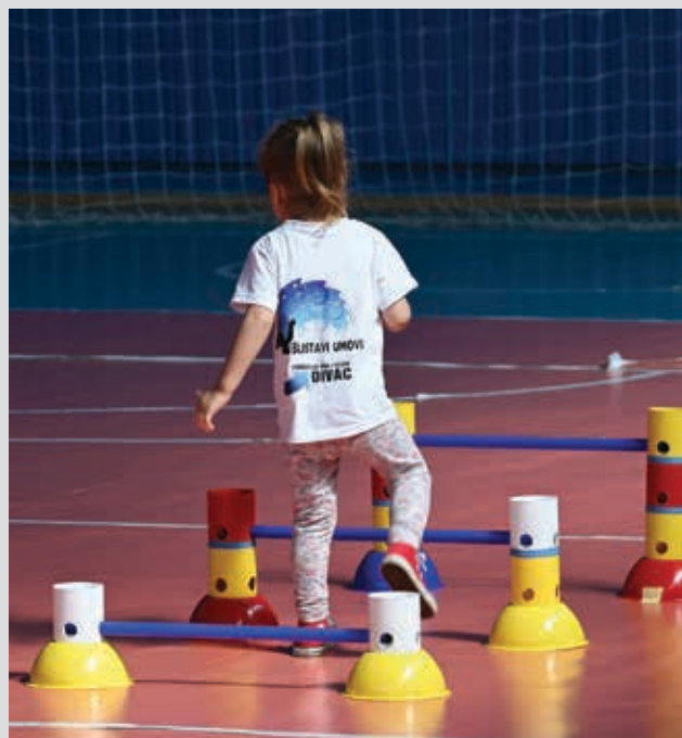
Inclusive workshop of the Defectology office BLISTAVI UMOVI

Also, through the competition, we supported the media in order for them to overcome the crisis caused by the pandemic, so the daily newspaper Danas received funds for the project Show solidarity today (Budi Danas Solidaran), thanks to which we were able to hear 10 stories about doctors working with covid patients in the red zone.