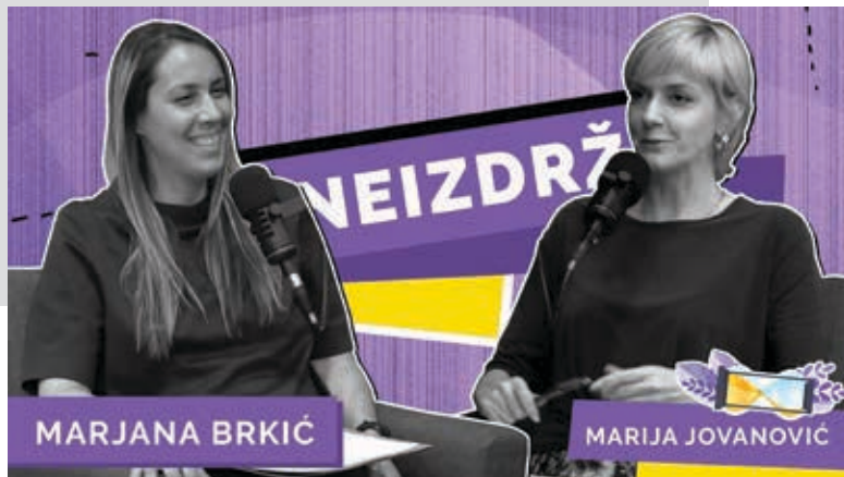
Podcast Unbearable – Why equality can't wait