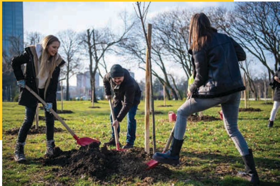
Divac Foundation in afforestation activity