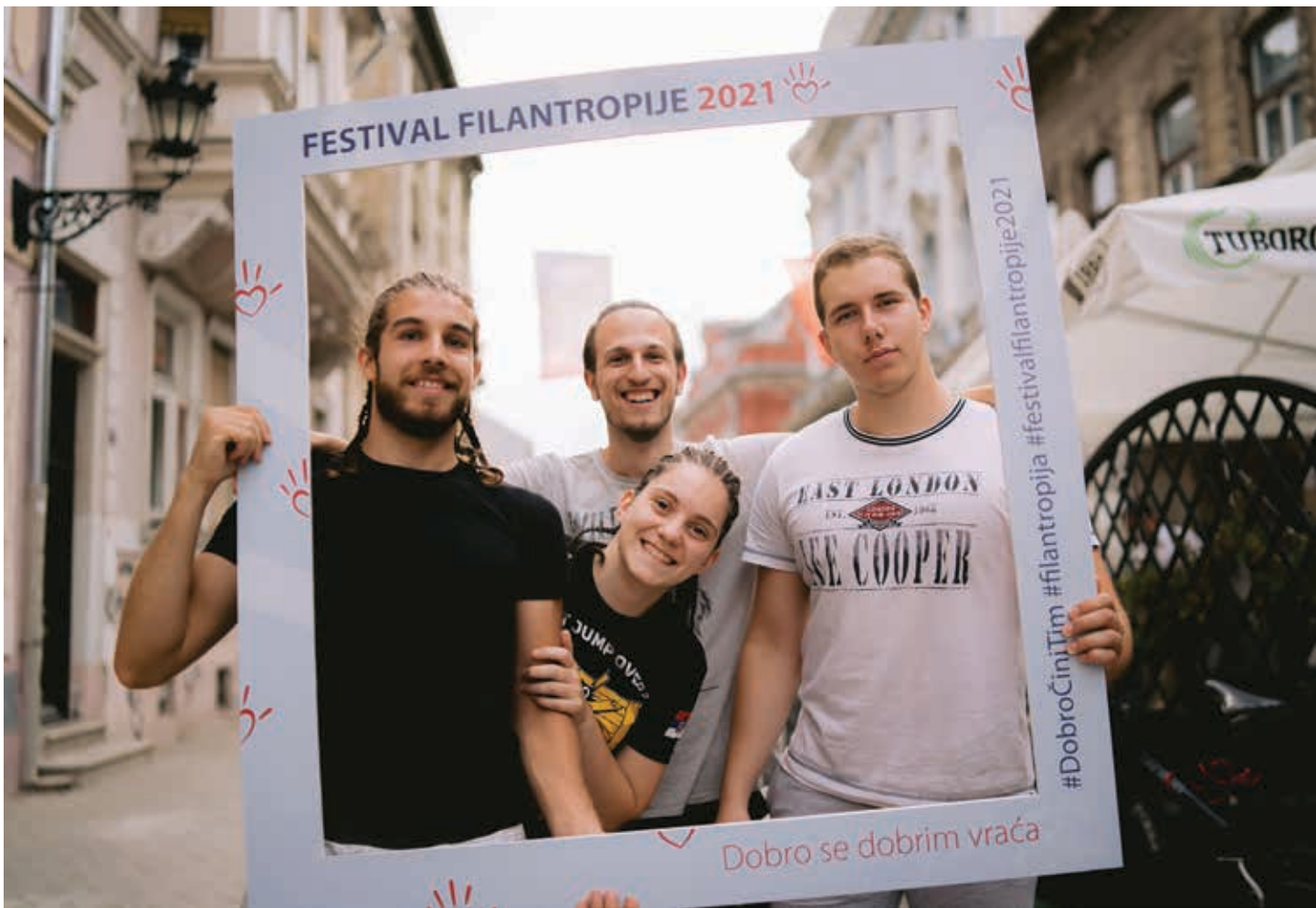
Street Stories, Novi Sad