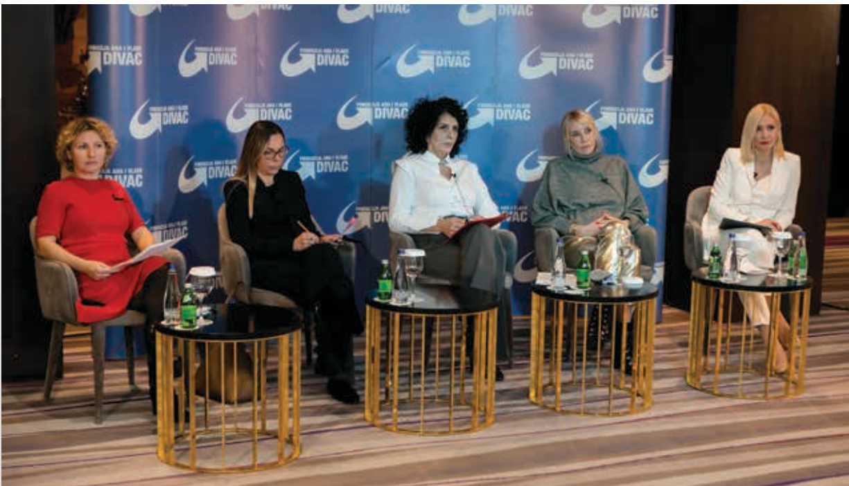
Final conference of the project Solidarity first and foremost

Bearing in mind the continuation of the crisis caused by the COVID-19 pandemic and the uncertain situation in which a large part of entrepreneurs in Serbia found themselves, the Ana and Vlade Divac Foundation provided free training and knowledge support to 10 businesses so that they could go through the digitalization.