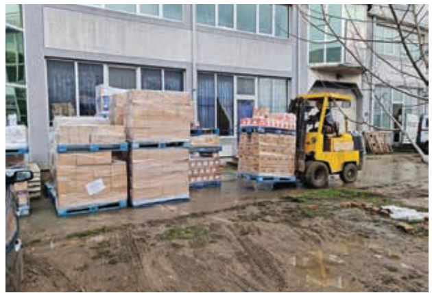
Donations to the Church Soup Kitchen in Belgrade

Thanks to our long-term cooperation with P&G, more than 6,000 health and hygiene products arrived to the Church Soup Kitchen and to the national association of parents of children with cancer Nurdor Srbija. This is the beginning of an activity within which we will distribute products to associations throughout Serbia in 2022 with the aim of supporting the most vulnerable categories of the population and providing them with products for personal hygiene and funds for their operational costs.