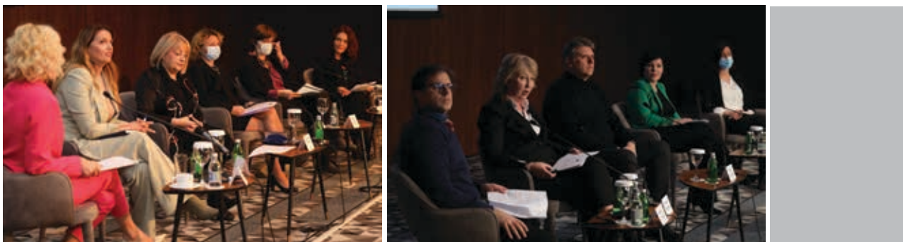
Project Equal - National Conference

Within the project, the following was organized: