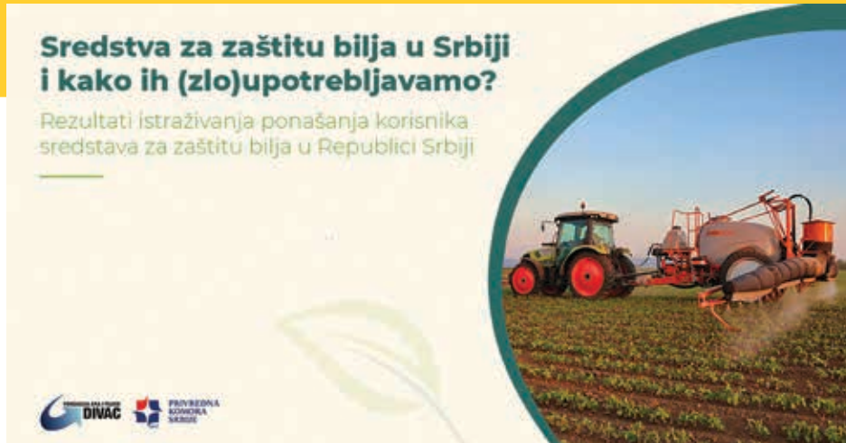
Research cover page

Goran Malidža, PhD, from the Institute of Field and Vegetable Crops in Novi Sad concluded.